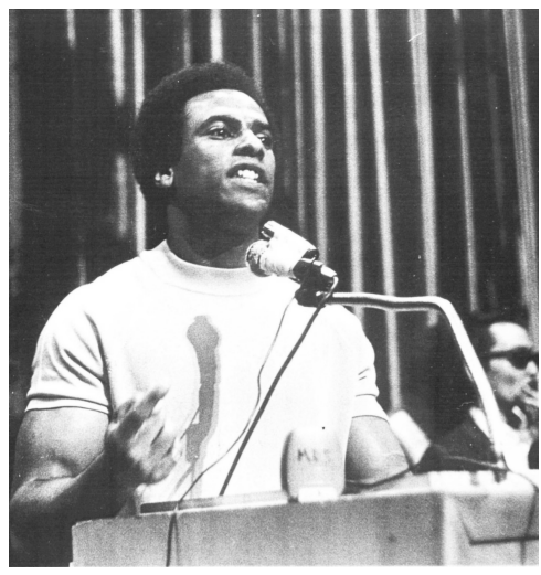
ASIAN COMMUNITY CENTER ARCHIVES

oming of age in the 1960s, Asian American students at universities developed a new, distinct consciousness as Asian Americans shaped by the racial and international context of the time. By 1968, when the Asian American population numbered about 1.3 million, 80 percent of Japanese Americans and about 50 percent of Chinese Americans and Filipino Americans, respectively, were born in the United States. Asian Americans had come to reach the same educational attainment as whites, but still earned substantially less because of racial discrimination. For example, in 1960 Filipinos earned only 61 percent of the income of whites with comparable educations. Japanese and Chinese also earned less than their