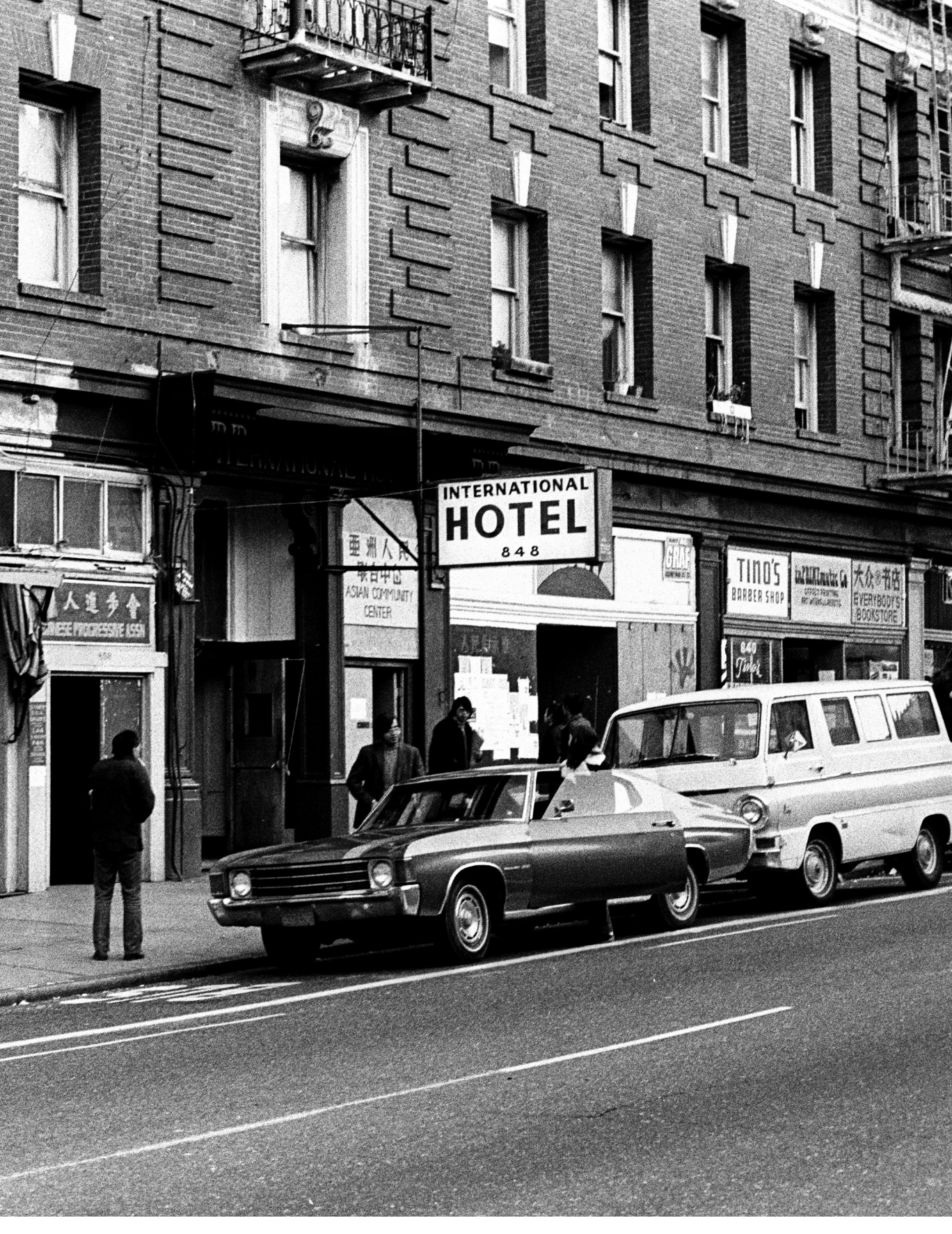
Elderly Filipino manongs and Chinese American residents fought displacement from their homes at the International Hotel in San Francisco in the 1960s and 1970s. Asian American students joined the campaign to fight the evictions and redevelopment and to preserve low-income housing for the elderly.